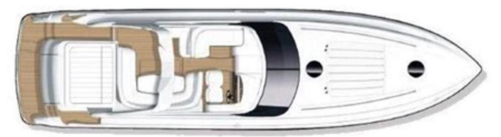
Upper accommodation layout